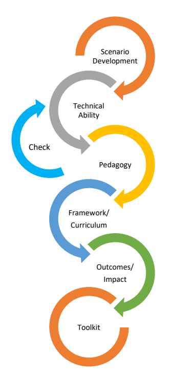
Figure 2: Conceptual framework of the project development

To develop the VRHealthLeader project the flow of development was used as outlined in Figure 2.